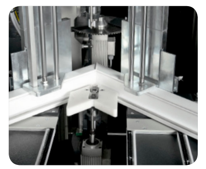
• Automatic profile defination feature thanks to measuring and control systems.